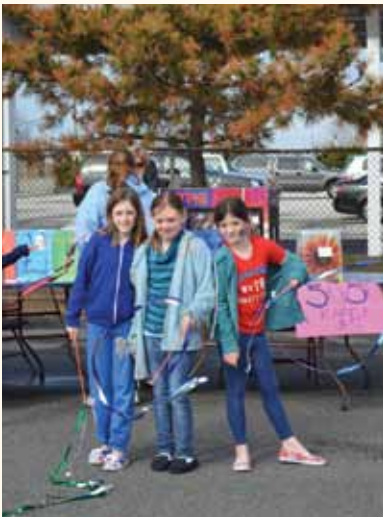
All other photos are of participants at the 15th Annual Little Bit of a Walk and Fun Run in Point Lookout, New York.